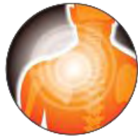
Back, Neck & Shoulder