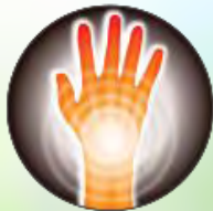
Hand & Wrist