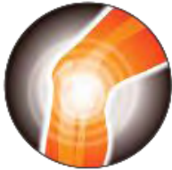
Knee & Elbow